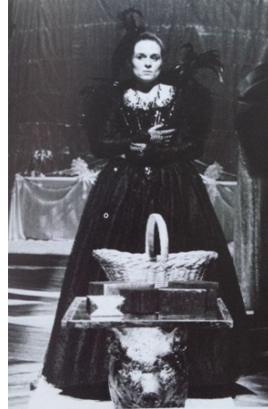
Sinead Cusack, 1982