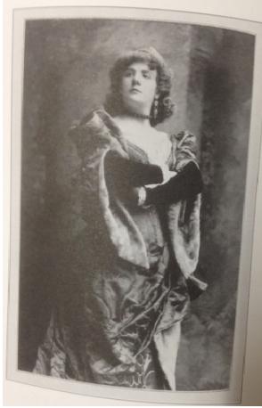
Ada Rehan, 1887